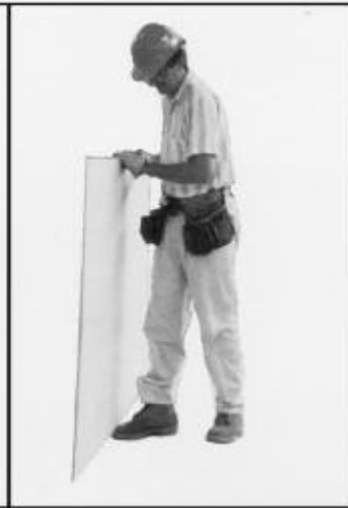
Lift sheet slightly and put toe under mid-point.