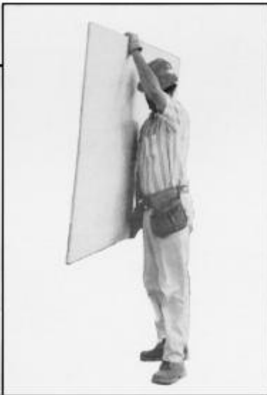
Stand and lift, maintaining the normal curve in your lower back.

To carry sheet material a distance, use a carrying handle.