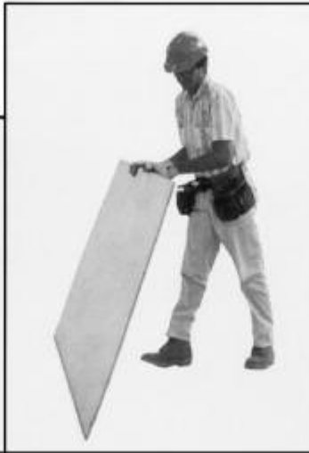
Tip sheet up to horizontal position.