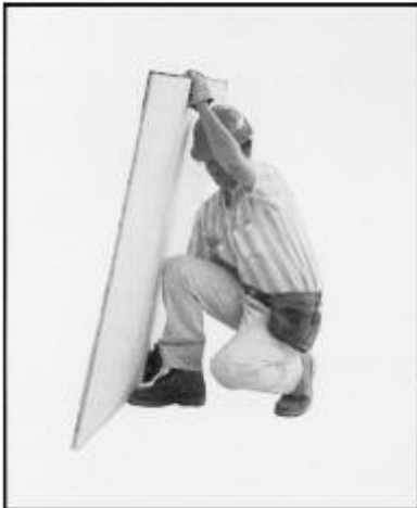
Bend at knees, keeping back upright. Slip free hand under sheet.