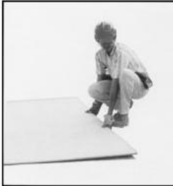
Bend knees, keeping back as upright as possible.

Demonstrate how to lift sheet material off the floor.